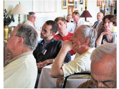
Listening to the Program