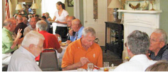
Table talk during lunch before the program