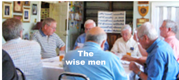
The wise men