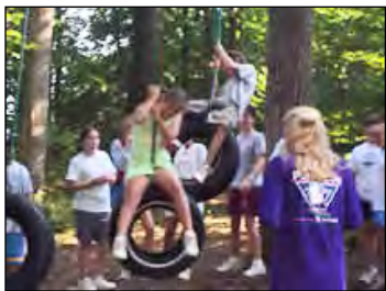
4-H members on the tire traverse