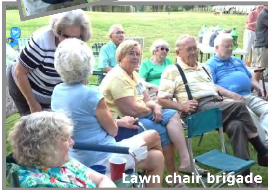
Lawn chair brigade