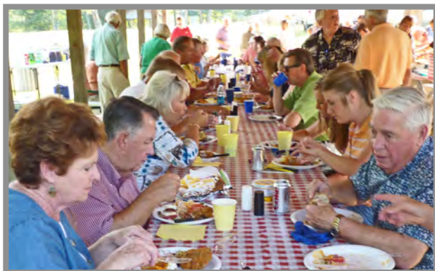
Our plates overflowed