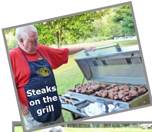
Steaks on the grill