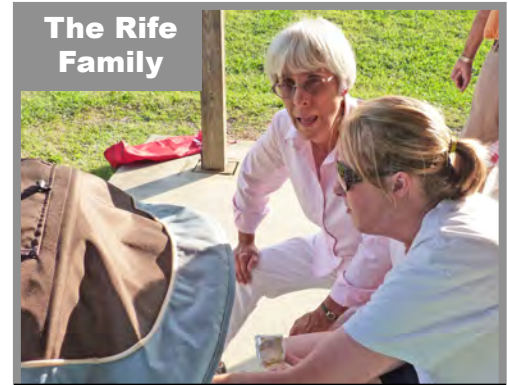
The Rife Family