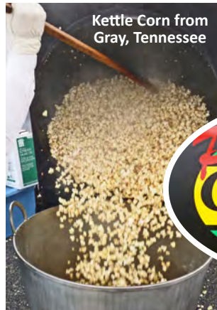
Kettle Corn from Gray, Tennessee