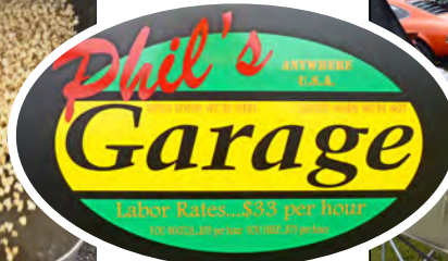
Open When We're Here Closed When We're Not