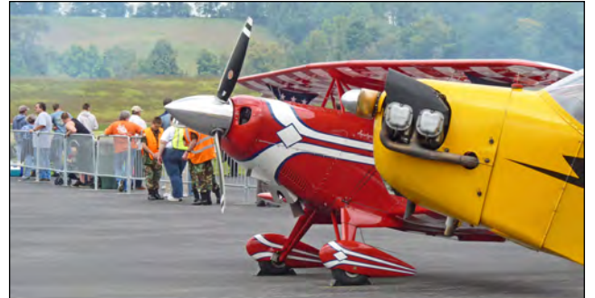
Waiting to fly