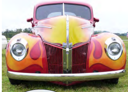
Nice Paint Job