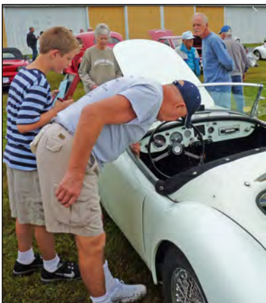
Look at this MG