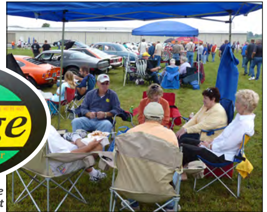
Car Owners' Social Tent