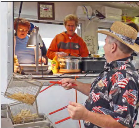
McClure River Kiwanis cooking fries